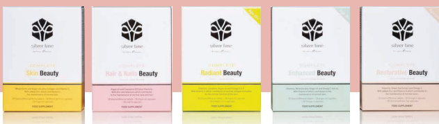
Our full range

For more information, visit www.fitnesspharma.uk.com