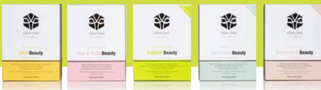
Our full range

For more information, visit www.fitnesspharma.uk.com