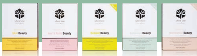
Our full range